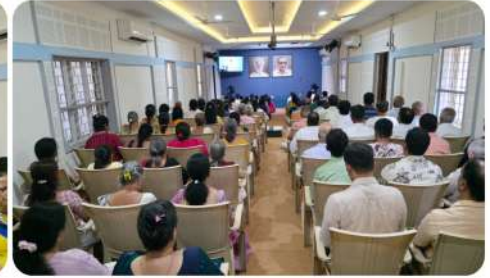
Orientation class was conducted at Taponagara on 1st May 2026.